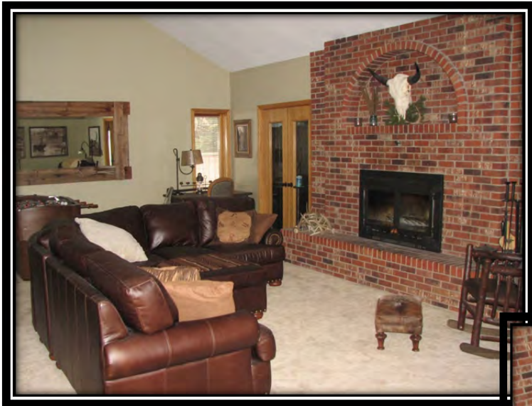
Fireplace in Living Room