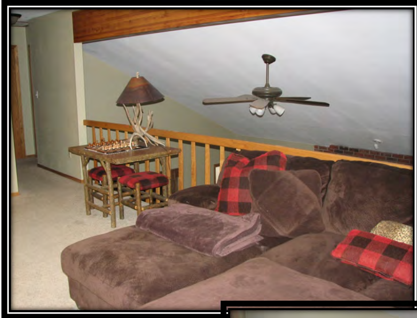
Loft Family Room