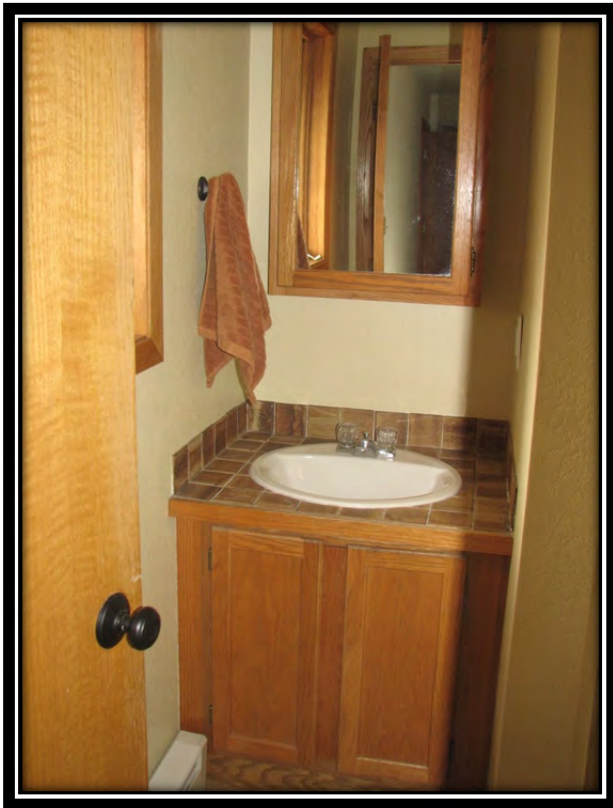
Bathroom off Laundry